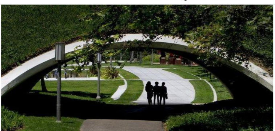
A review of almost 90 UC system health faculty members found that about two-thirds did not report all of their outside income. Above, the campus of UC Irvine.